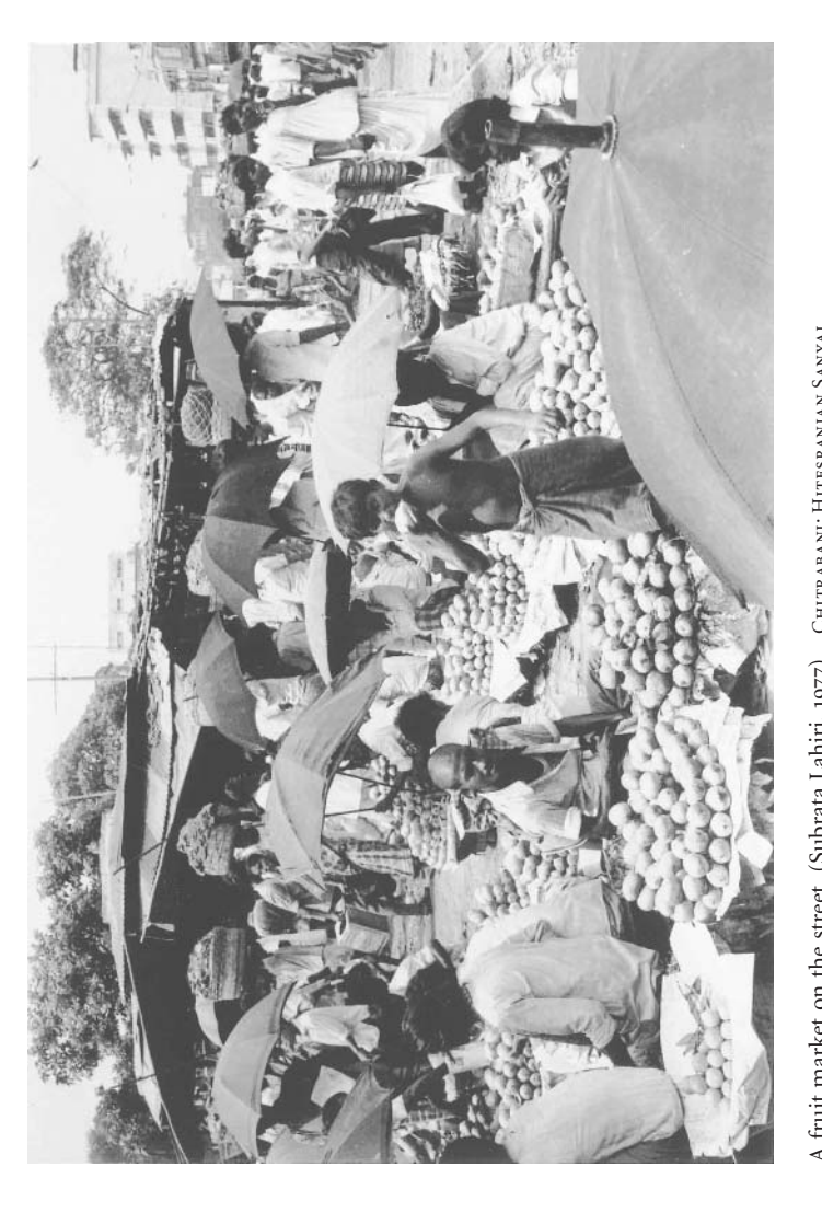
A fruit market on the street. (Subrata Lahiri, 1977) Chitrabani; Hitesranjan Sanyal Memorial Archive of the Centre for Studies in Social Sciences, Calcuta