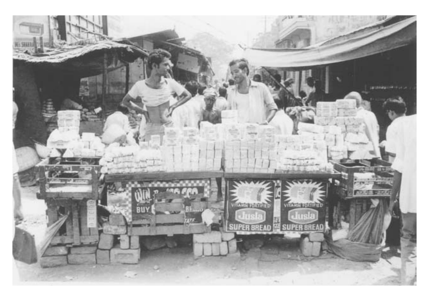
Food stalls.