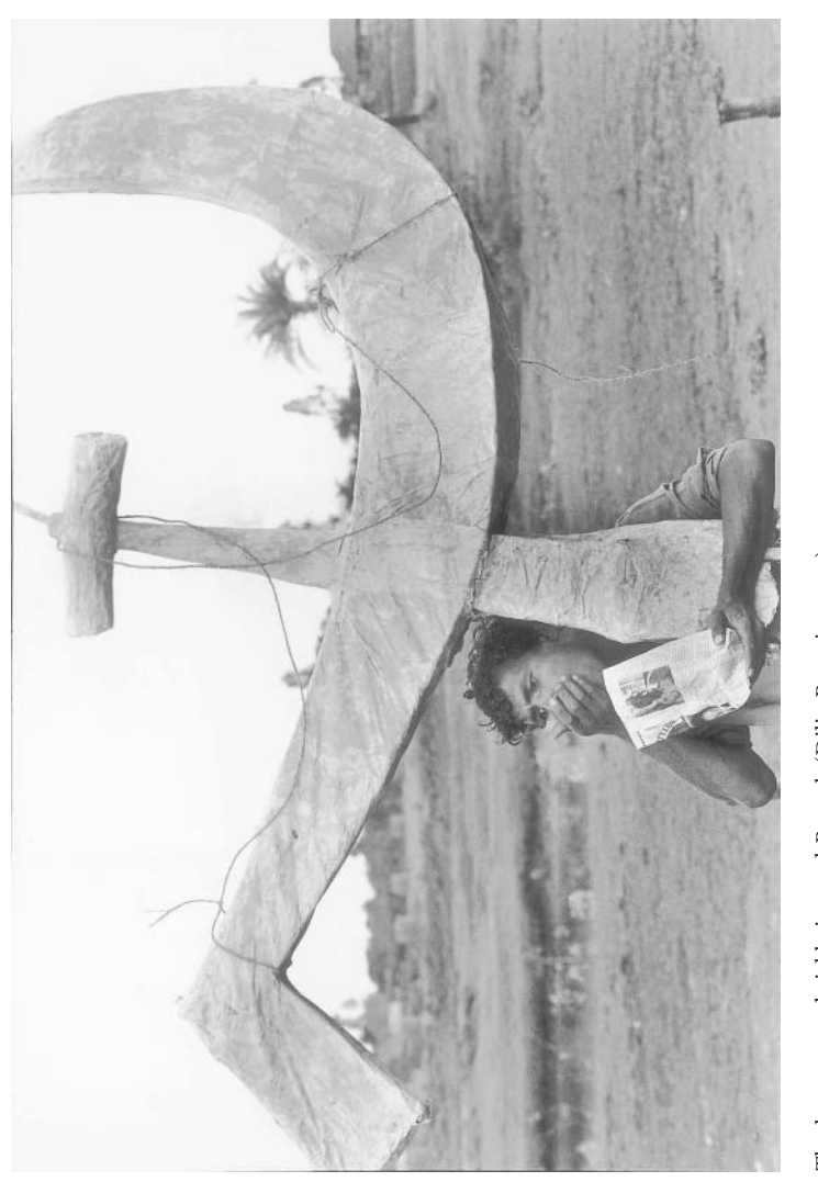
The hammer and sickle in rural Bengal.