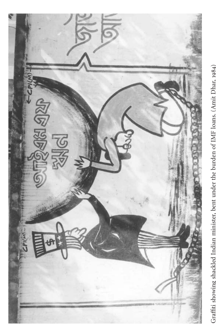
CHITRABANI; HITESRANIAN SANYAL MEMORIAL ARCHIVE OF THE CENTRE FOR STUDIES IN SOCIAL SCIENCES, CALCUTTA Graffiti showing shackled Indian minister, bent under the burden of IMF loans. (Amit Dhar, 1984)