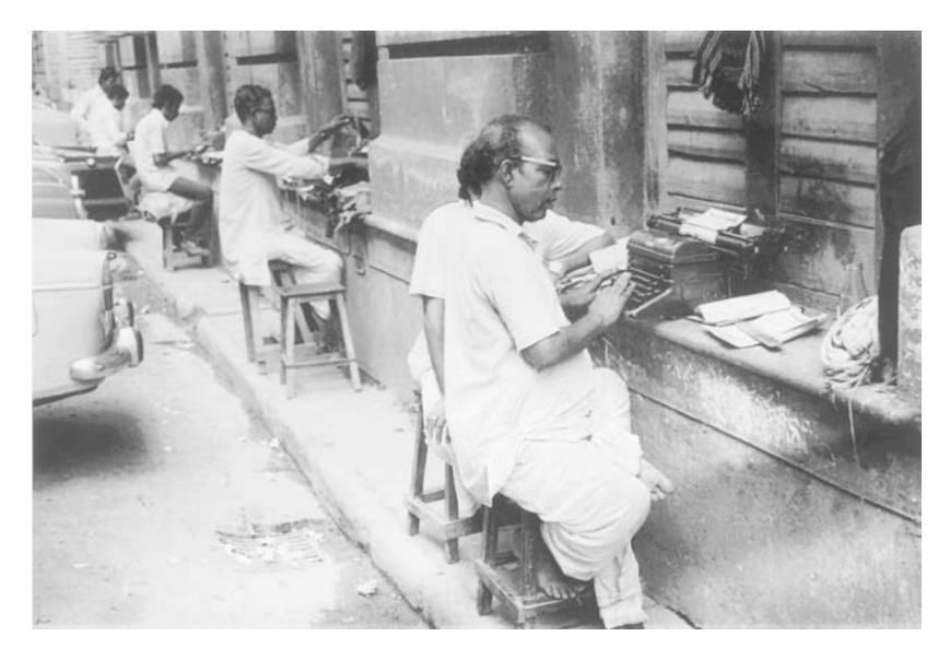
Pavement typists.