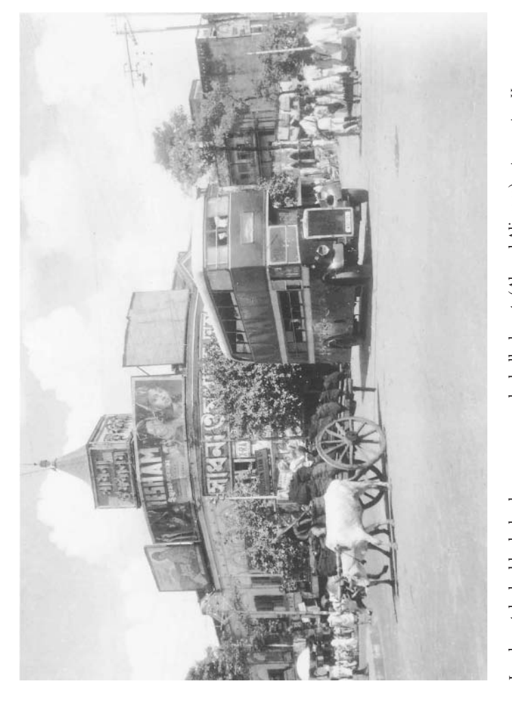
London-style double-decker bus veers around a bullock cart.