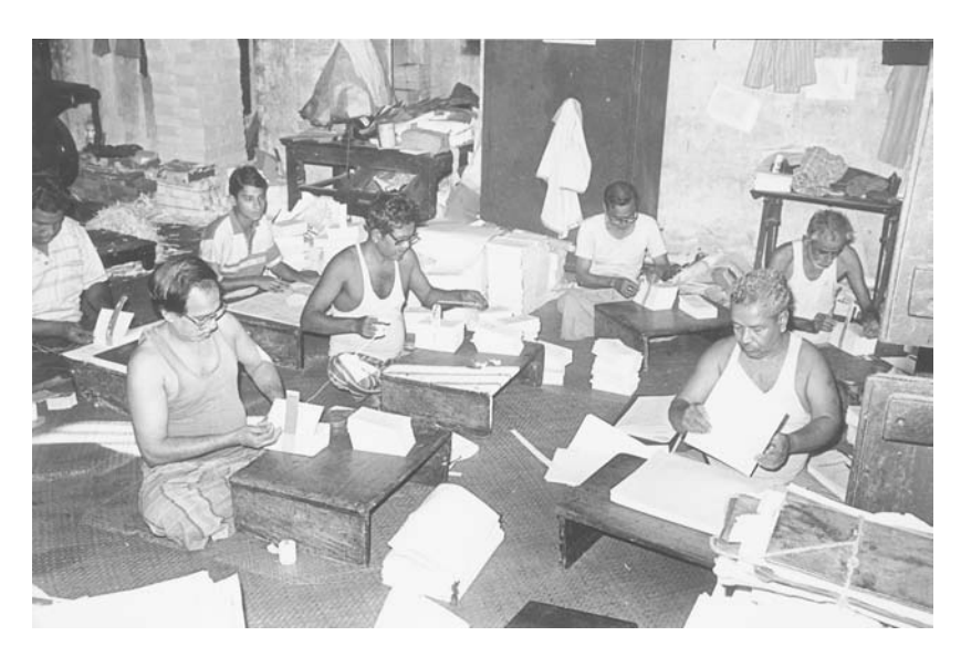
A bookbinding workshop. (Bikash Bose, 2003) BIKASH BOSE