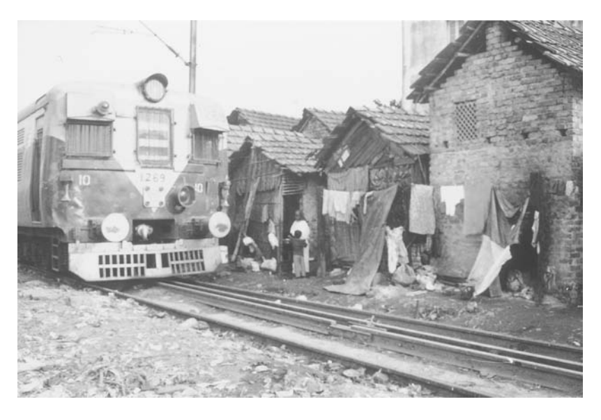
Domestic life goes on inches away from the railway tracks. (Sabuj Mukhopadhyay, 2003) Sabuj Микнораdнуау