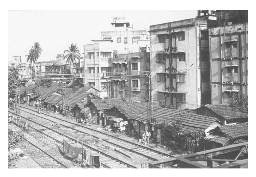
A squatter settlement on railway land. (Sabuj Mukhopadhyay, 2003) Sabuj Микнораднуау