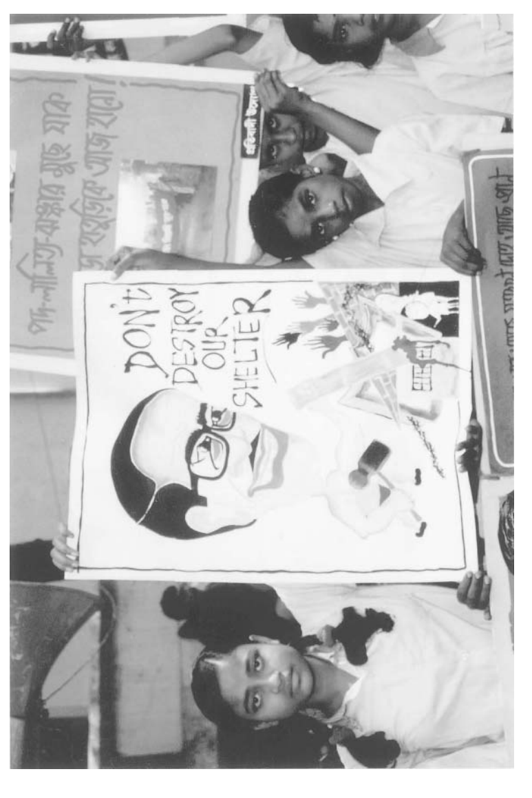
Children from squatter colonies demonstrate to save their homes. (Sabuj Mukhopadhyay, 2002) Sabuj М икнорарнуау