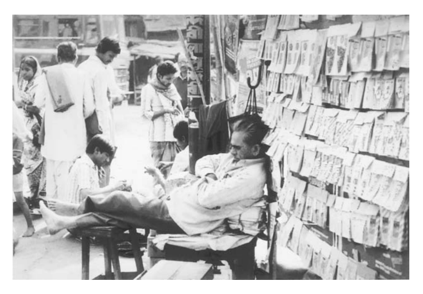
Selling lottery tickets. Business is not brisk.