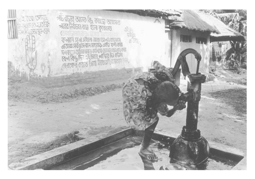
Slogans on the wall for village council elections. (Dilip Banerjee, 1993) DILIP BANERJEE