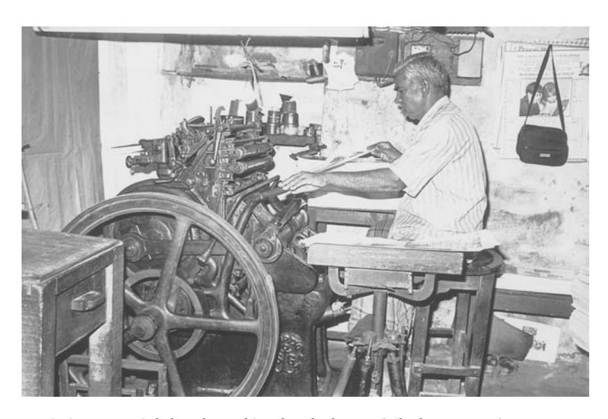
A printing press. Little has changed in a hundred years.