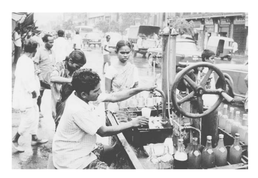
Selling juice.